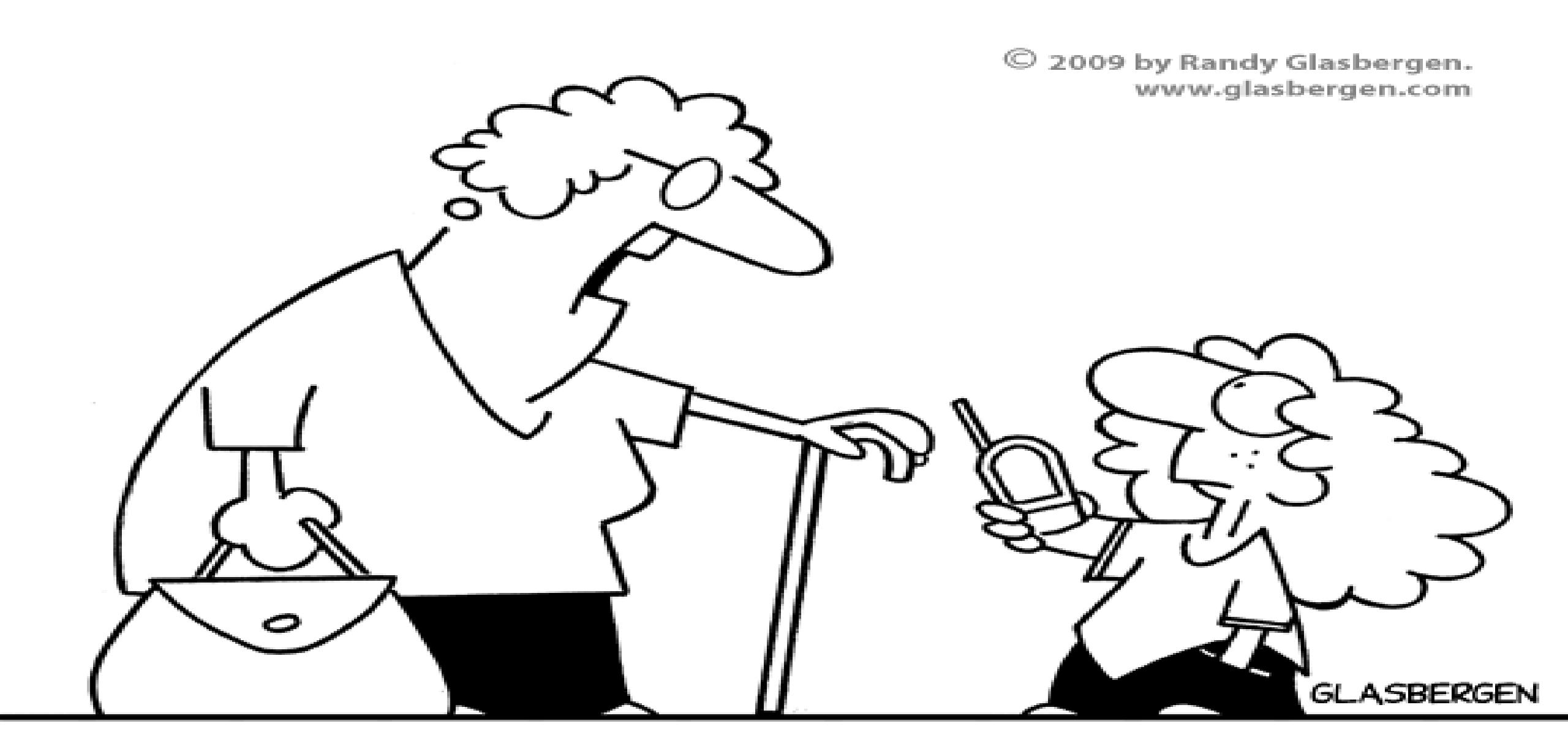
"Wireless communication is nothing new. I've been praying for 75 years!"