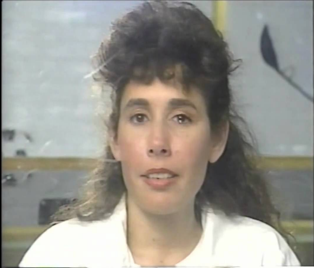
Karla Fay Tucker