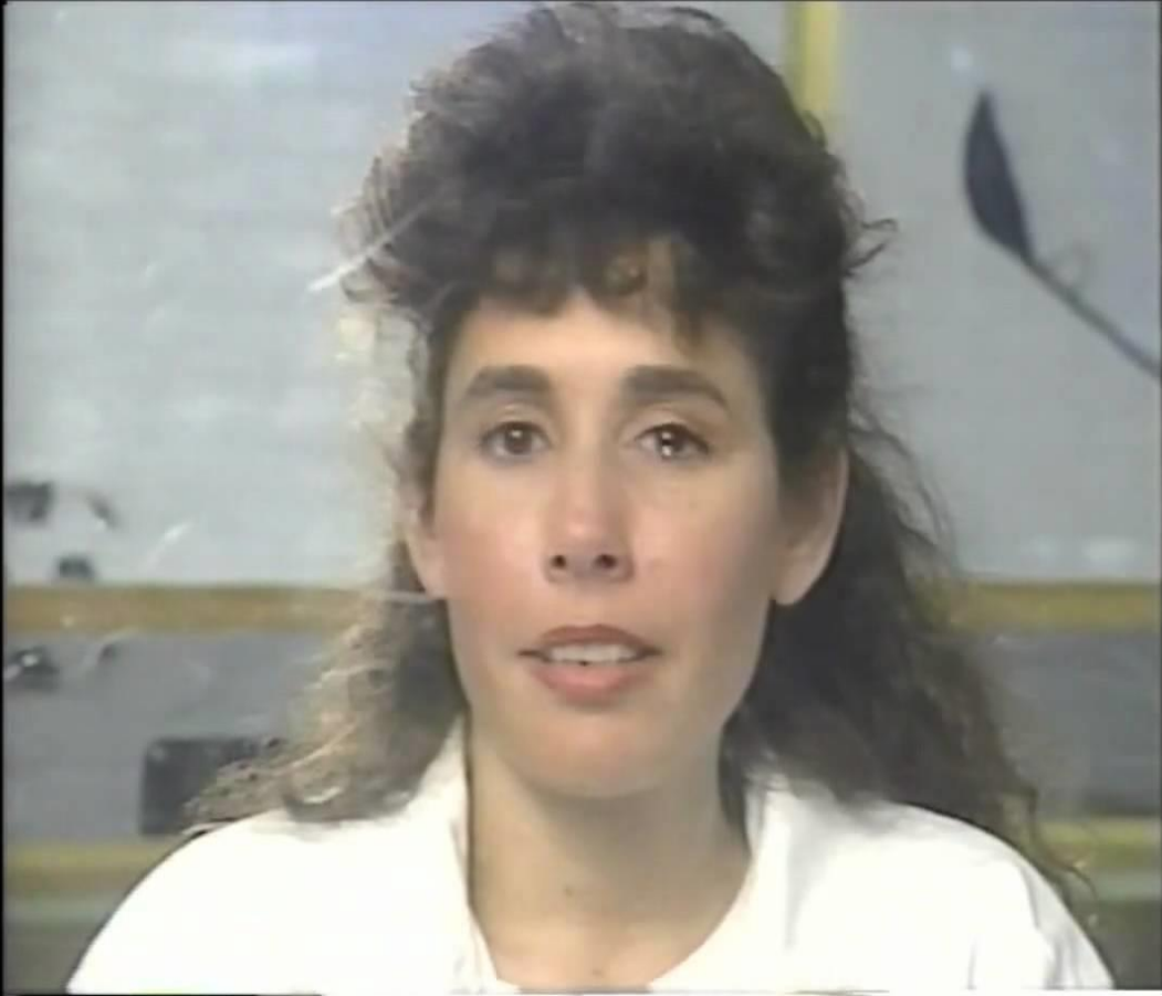
Karla Fay Tucker